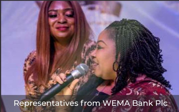
Representatives from WEMA Bank Plc