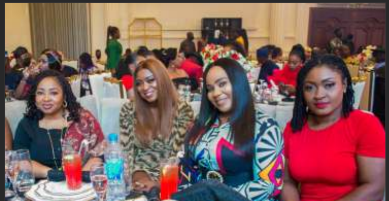
REPRESENTATIVE FROM WEMA BANK