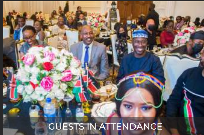
GUESTS IN ATTENDANCE