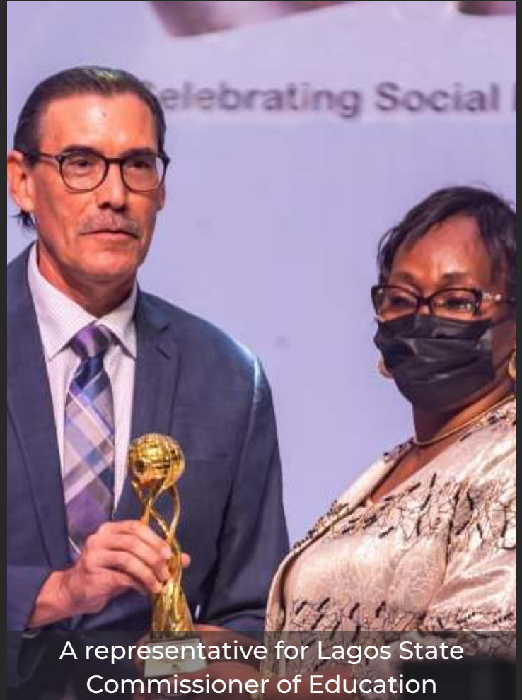
A representative for Lagos State Commissioner of Education