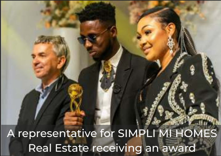
A representative for SIMPLI MI HOMES Real Estate receiving an award