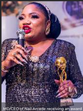
MD/CEO of Nail Arcade receiving an award