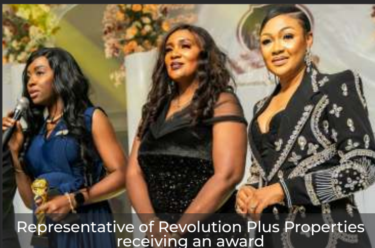
Representative of Revolution Plus Properties receiving an award